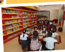
Chinese American Library