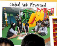
Central Park Playground

Olifant's unique thematic facilities and classrooms are specially designed to enable each child to develop intellectually, socially, culturally, emotionally, and physically. Dynamic learning methods such as the moving classroom and daily uniform personal choice, keep the children stimulated and enhance the learning experience.